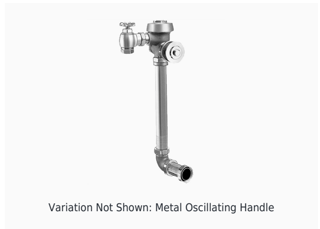
Variation Not Shown: Metal Oscillating Handle